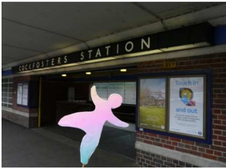
We started out at Cockfosters.

including a children's multi-sensory activity at Animal Welfare Centre, Trent Country Park