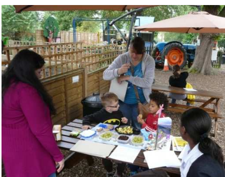
We ate a healthy snack ... talked... and listened ...finding out more