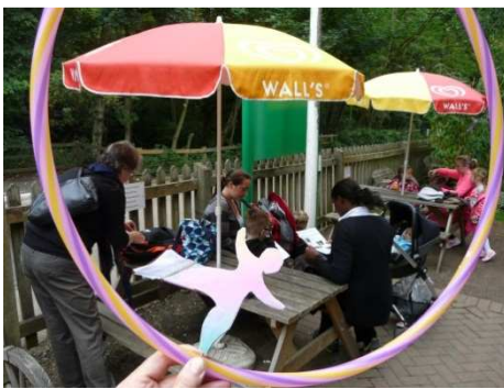
There we met with families and children.