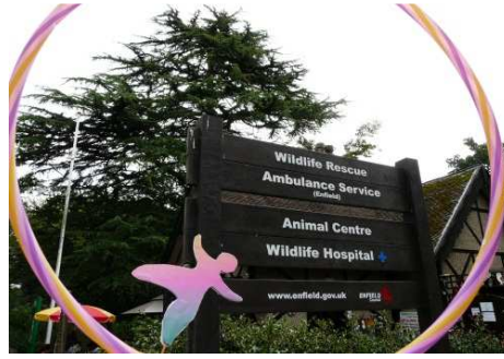
The Animal Centre was not far away