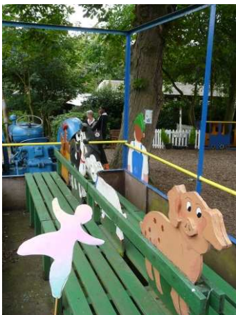
We got to know animals by sight, sound and touch...