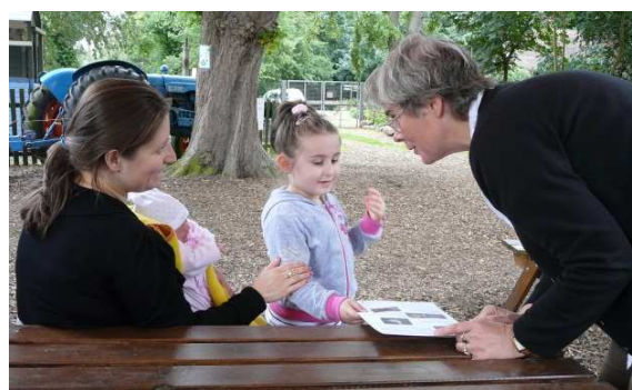
about animals, children's centres, Walk4Life and Walk the Loop.