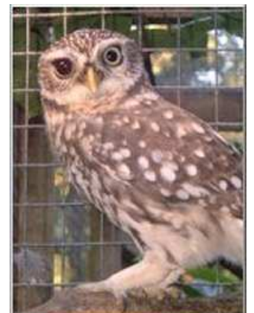
We adopted "Titch" the owl.