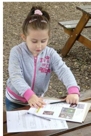
...and learned through pictures and words.